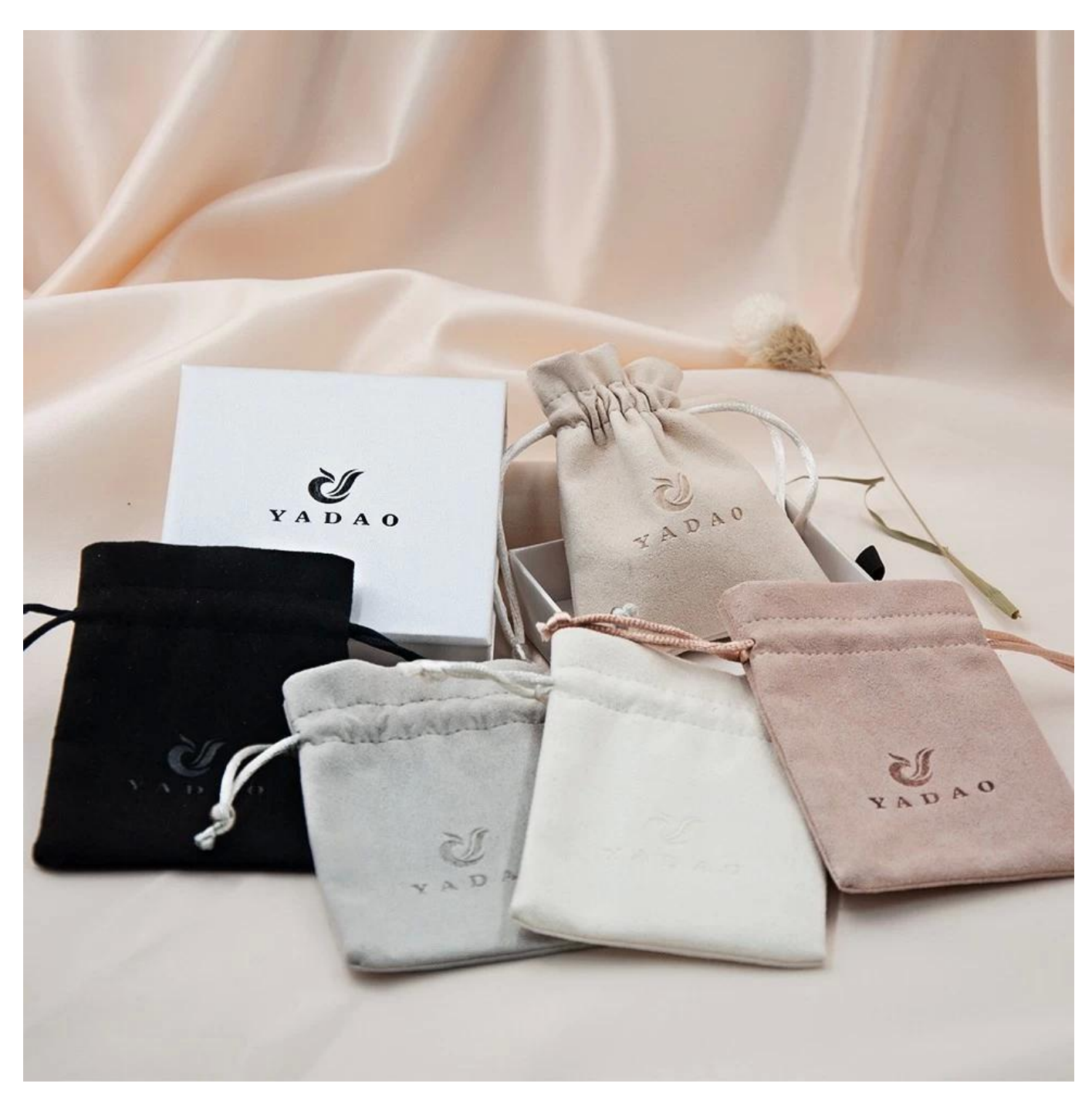
Yadao"s office *