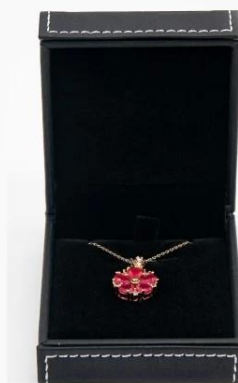
pendant box: 7*8.3*3.5