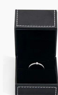
ring box: 6*6.8*5.8