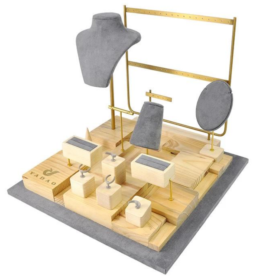
★ Yadao's office ★