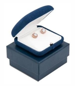
earring box: 6*6*2.8