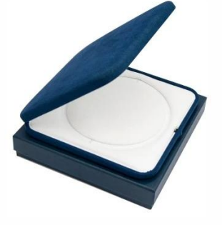
set box: 18.5*18.5*3