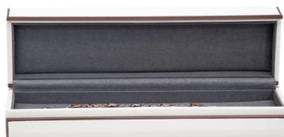
bracelet box: 24*6.8*5.8 (L*W*H)