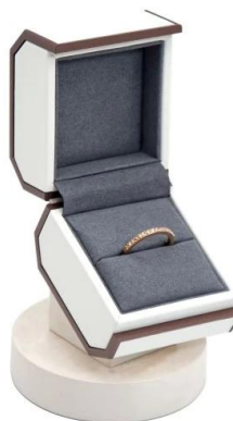
ring box: 6*6.7*5.8 (L*W*H)

*All off the size are measured by hand, as for different measurement method Please refer to actual products if there is any error (unit:cm)