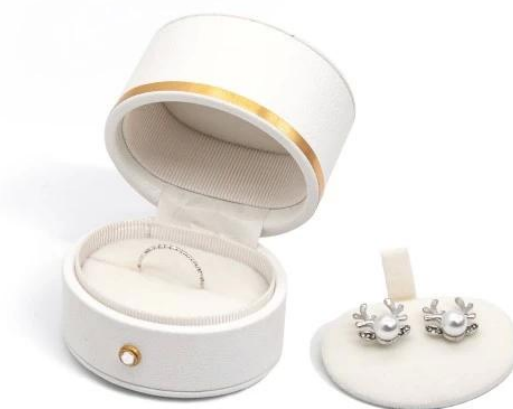
Ring box: 6.7*5.8*6.4