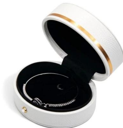
bracelet box: 10*9*5.2