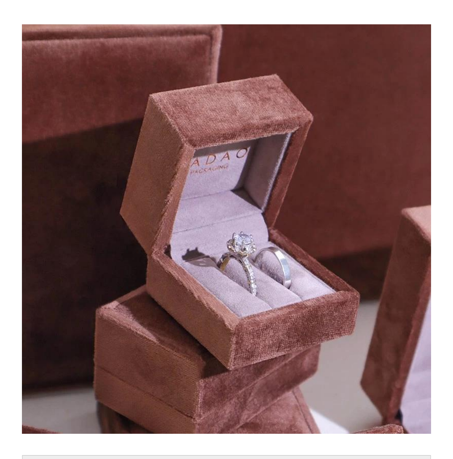
Welcome to our office