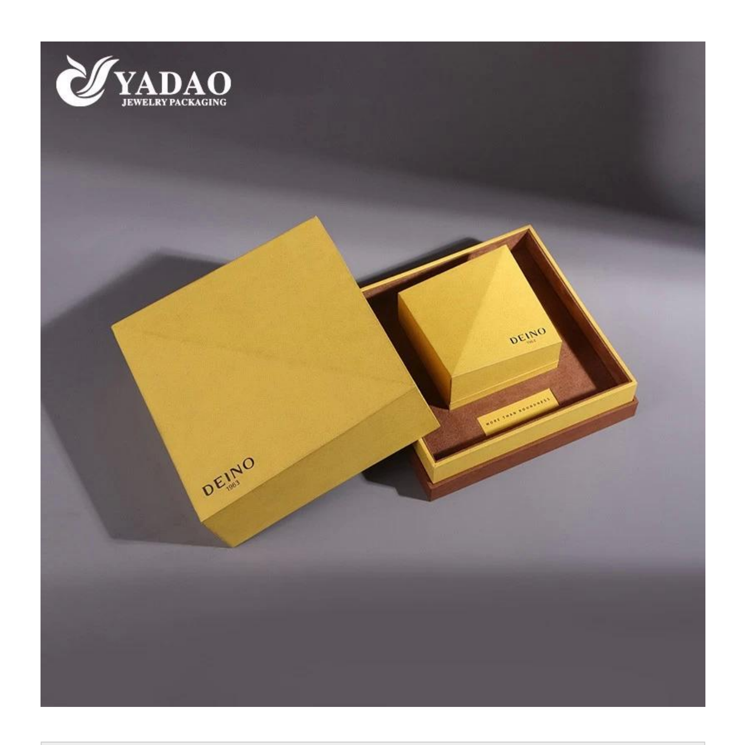
Welcome to our office