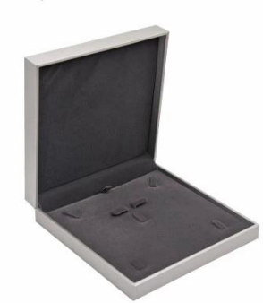
set box: 19*19*4.5