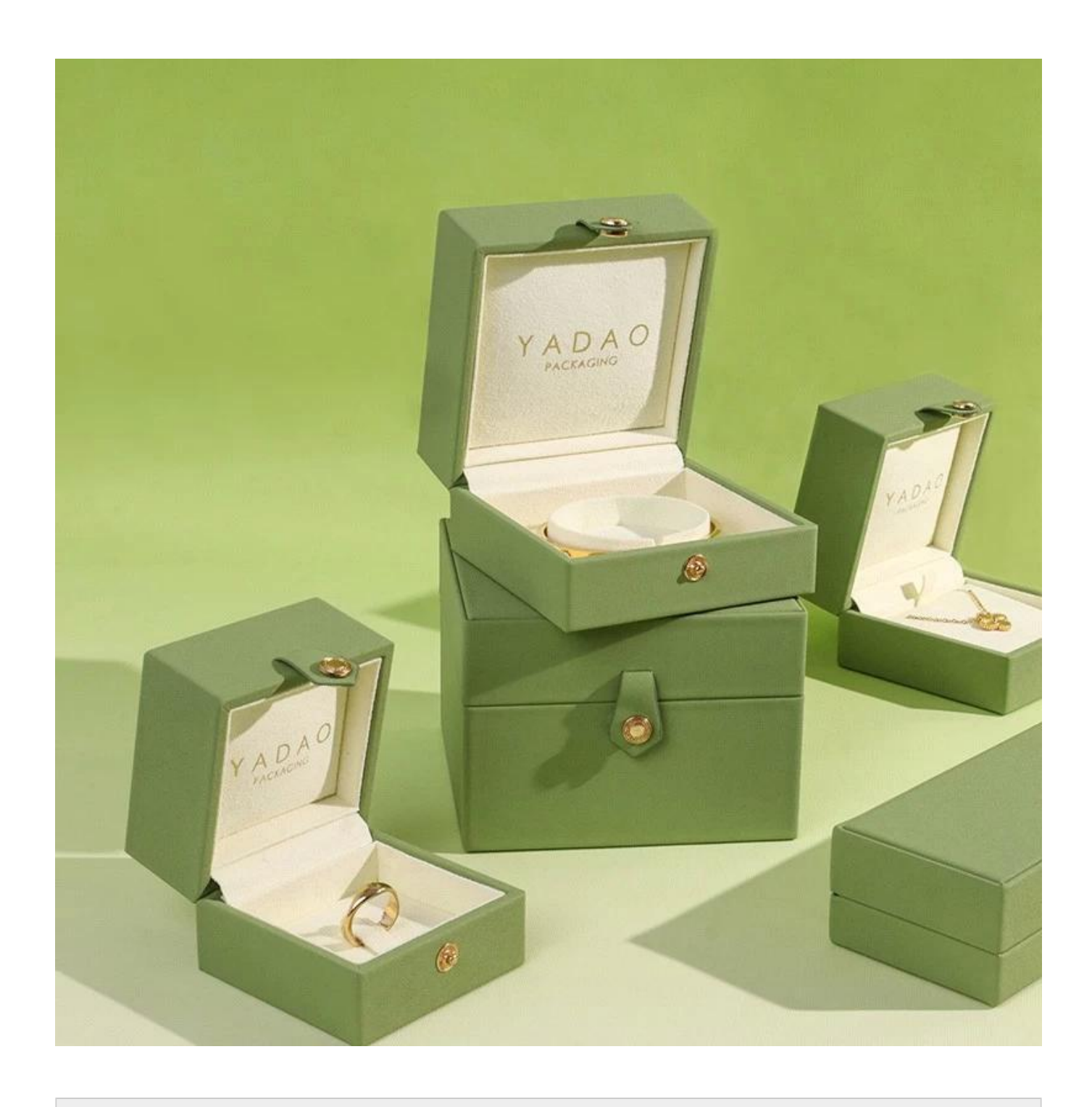
Welcome to our office