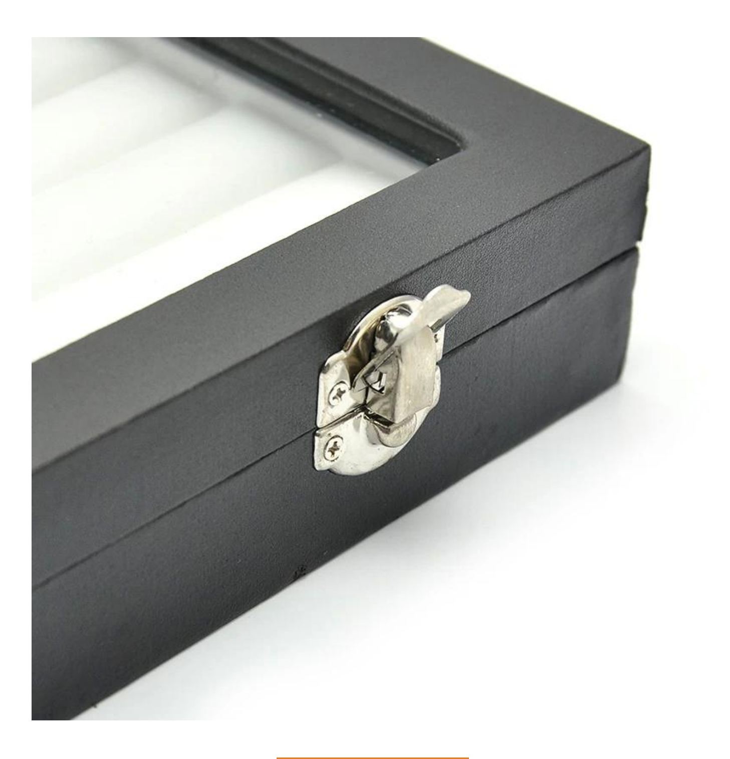
★ Yadao 's office ★