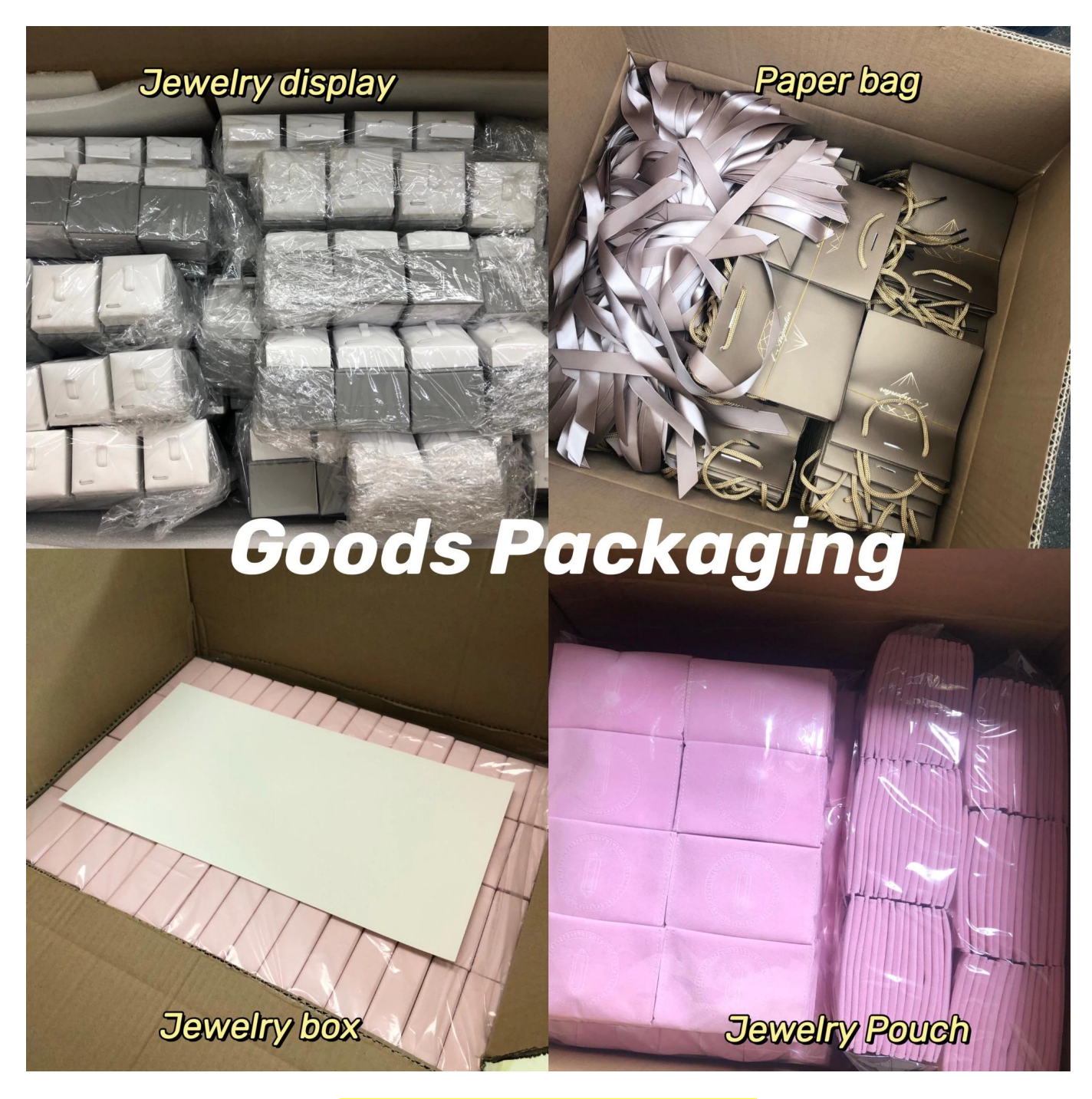
Feedback from our customers