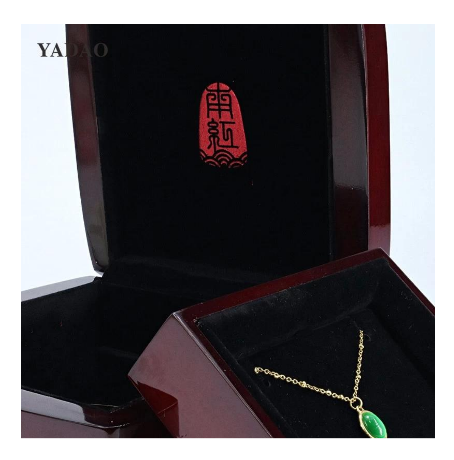
Yadao's office *