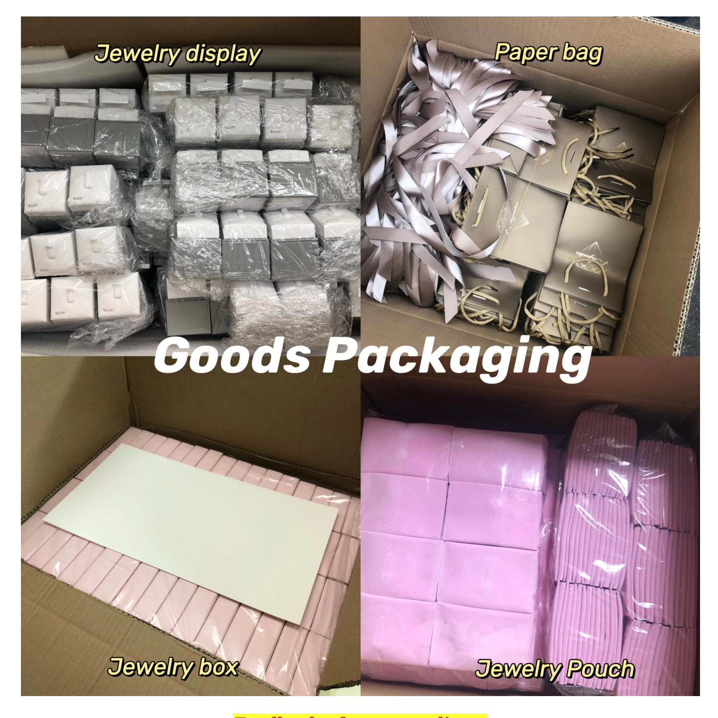
Feedbacks from our clients