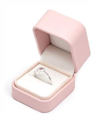
ring box: 5.2*6*4.7