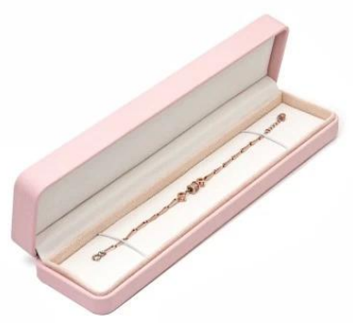
bracelet box: 22*5.5*3