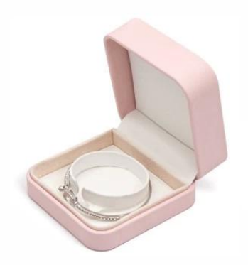
bangle box: 9*9*4.3