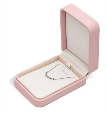
pendant box: 7.2*10.2*3.5