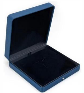
set box: 19*19. 5*4. 3