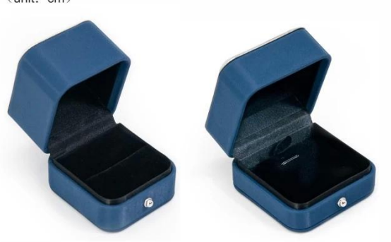
ring box:6*6. 5*6