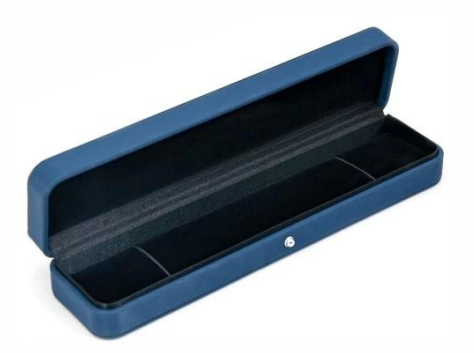
bracelet box: 23.8*5.8*3