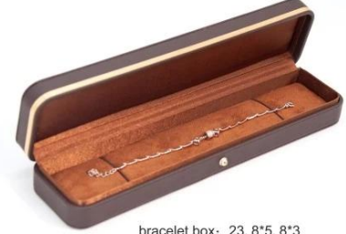
bracelet box: 23.8*5.8*3