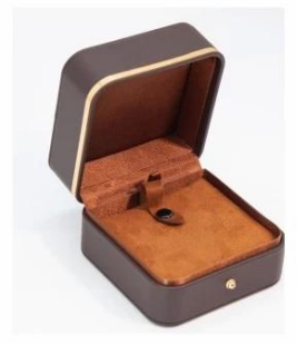
bangle box: 9.5*9.5*5.5