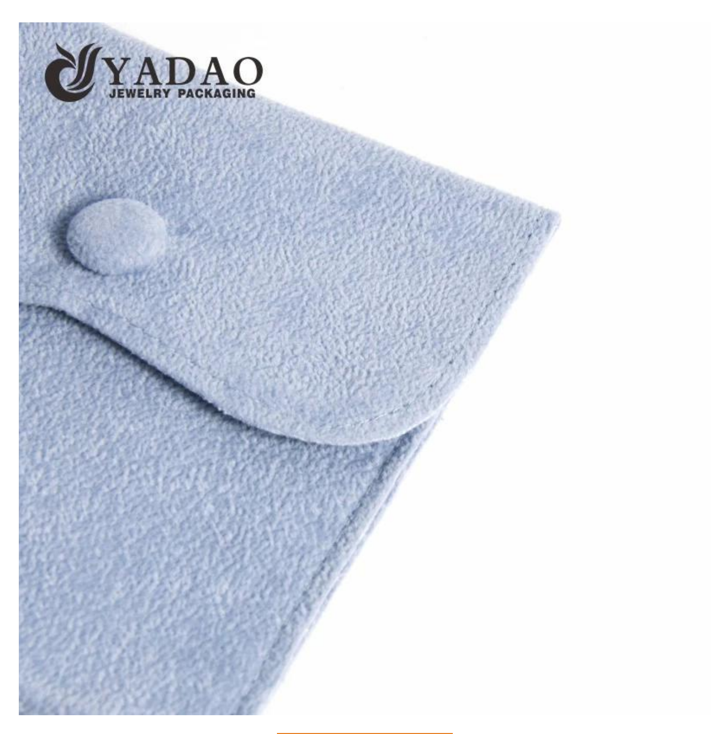
Yadao's office *