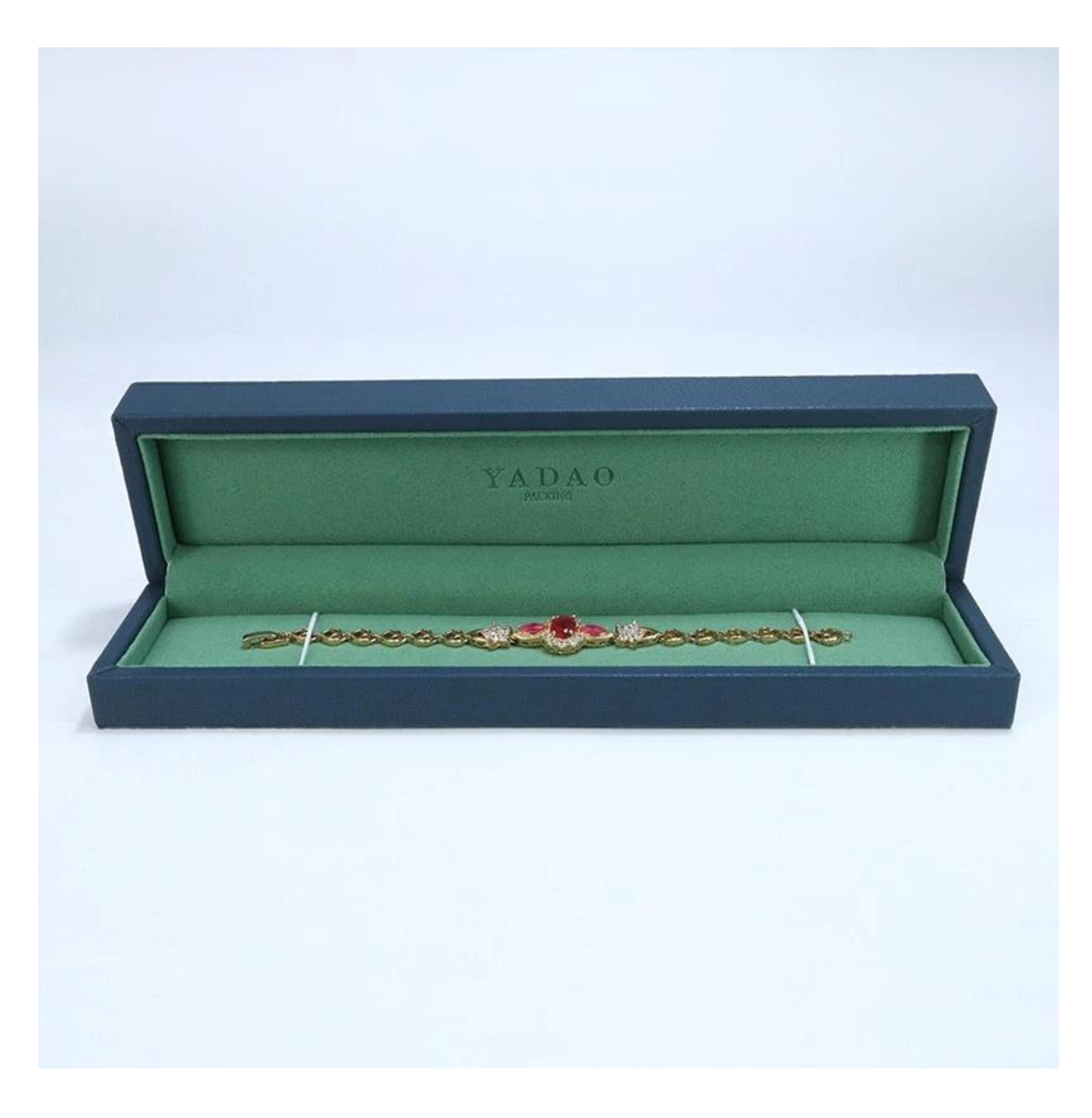
⊗ Yadao's office ⊗