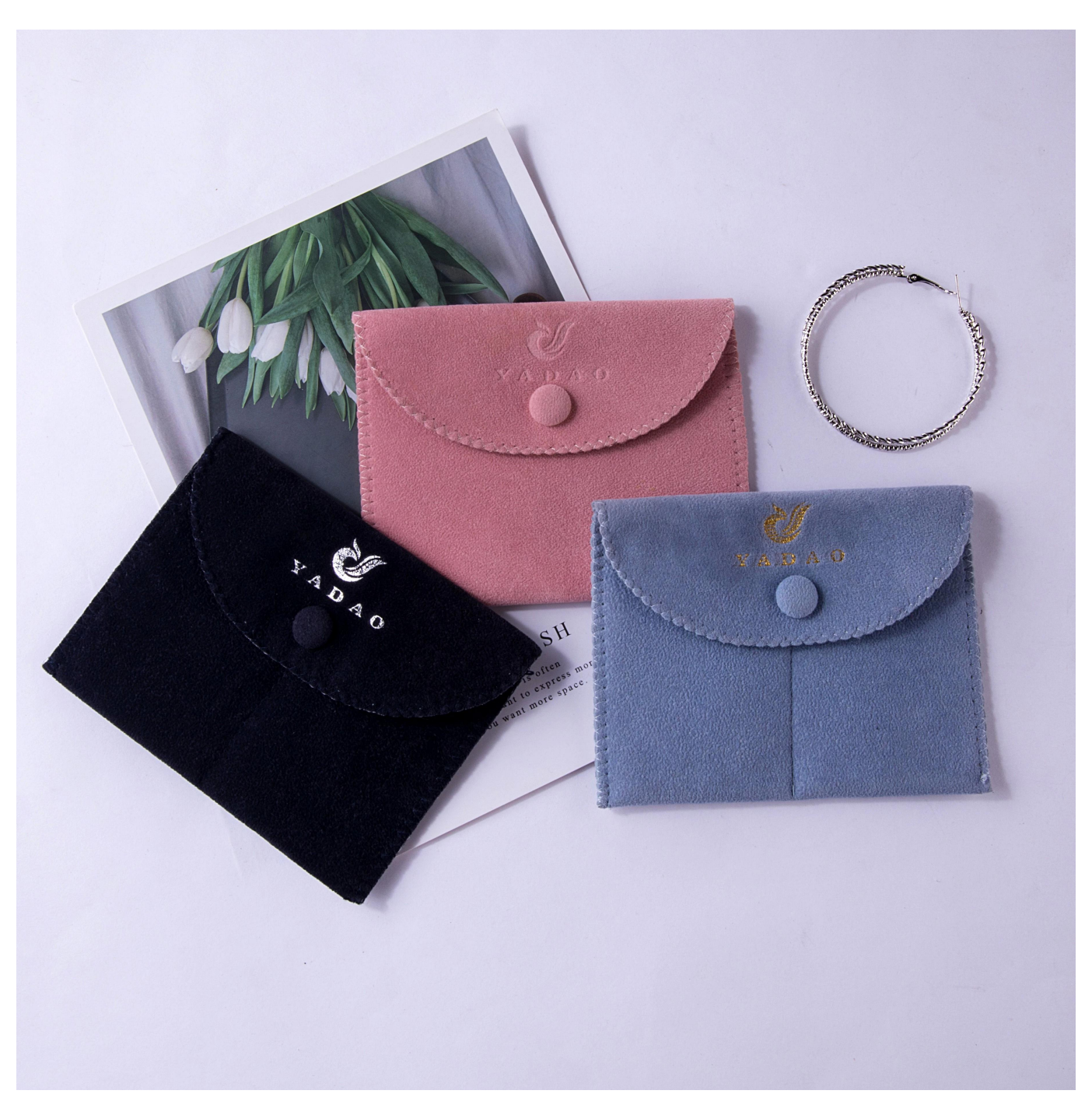
Yadao's office *