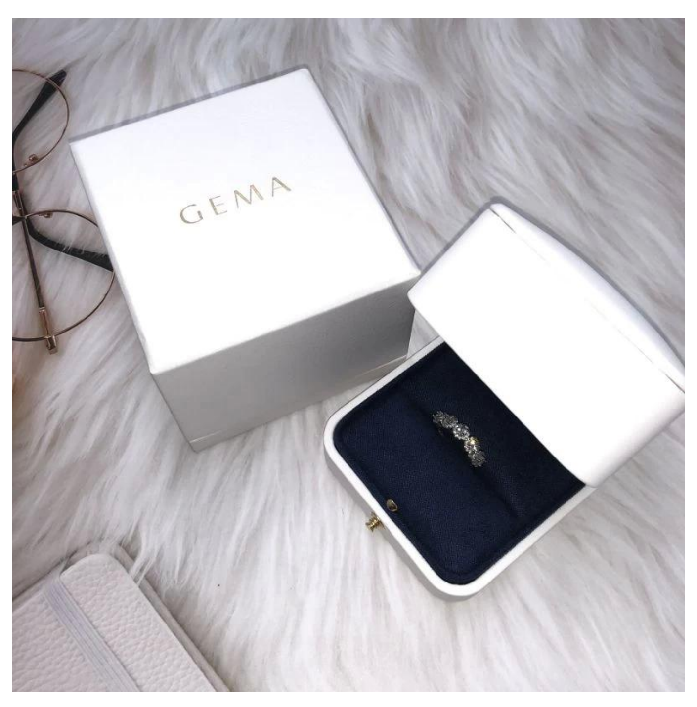
Yadao"s office *