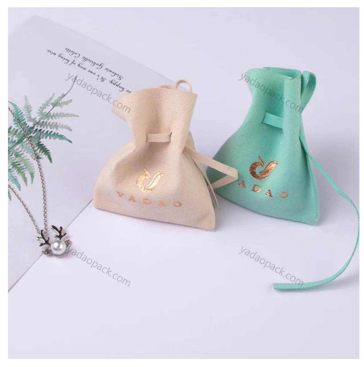
Yadao"s office *