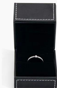
ring box: 6*6.8*5.8