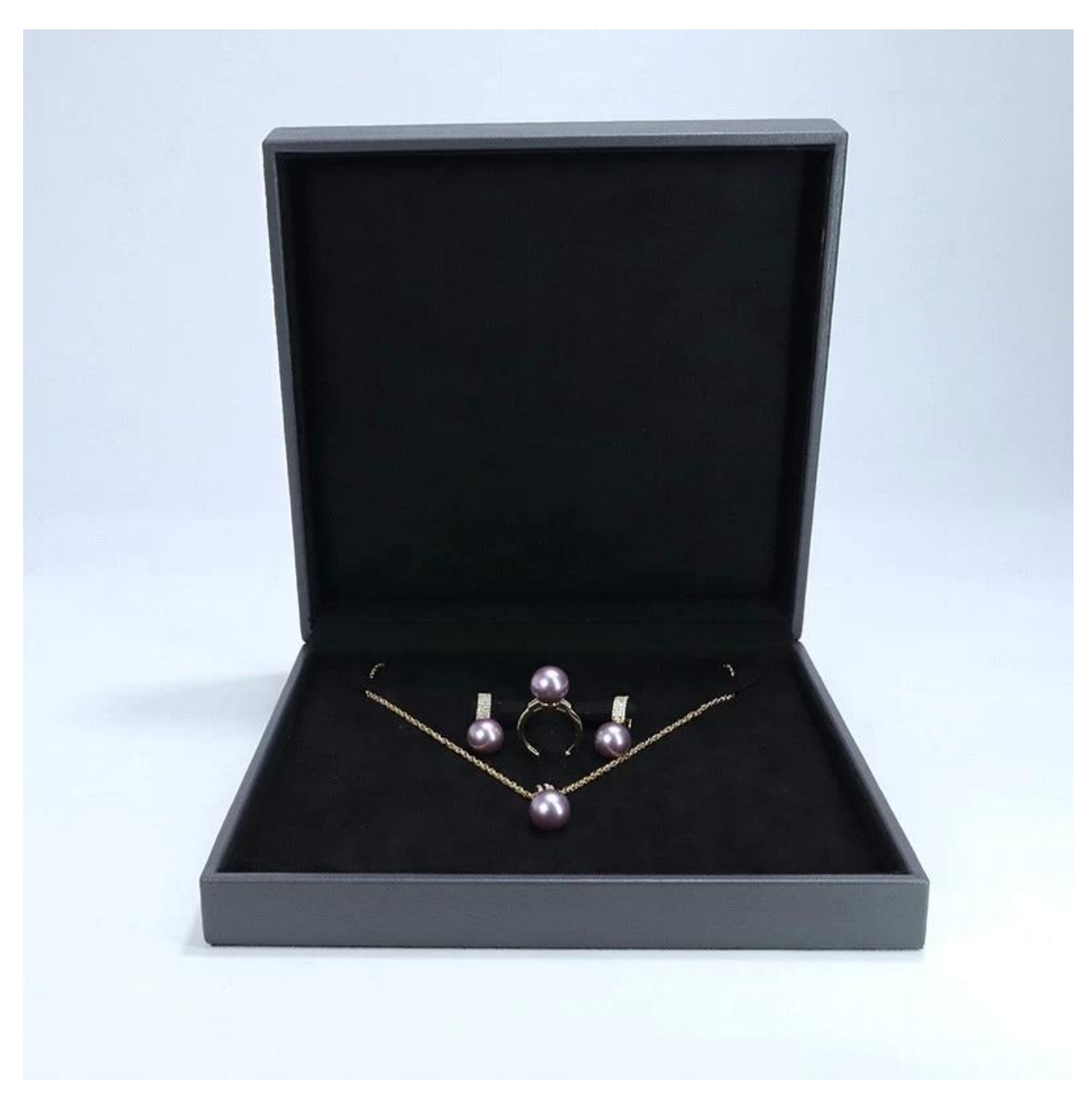
★ Yadao's office ★